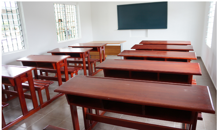
Refurbished and equipped classroom at the Libreville prison.

All these activities have a role to play in the reconstruction of these young people who are in conflict with the law and who, with their dignity restored, will be better equipped to hold their rank within society.