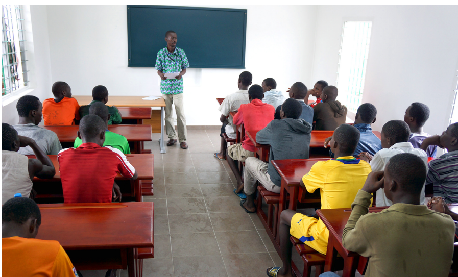
A course taking place with the young incarcerated minors.