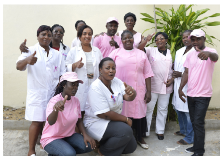
Voluntaries and the medical team of London's Center.

women, a pillar of the family and of our nation: from the 6th to the 31st October this year, the first Gabonese edition of "Pink October" turned into a far-reaching awareness campaign for early female cancer screening under the slogan "Female cancer, discuss it with the women you love!"