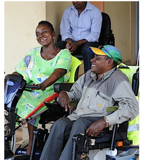
Beneficiaries of the Solidarity Handicap Program.

Since its creation, the SBO Foundation has particularly supported fragile and precarious groups, and specifically people living with motor disability. In the context of our Initiative for Solidarity and in addition to provisions made by the public sector (1) , we make every effort for their living conditions and social insertion to improve day by day in our country.