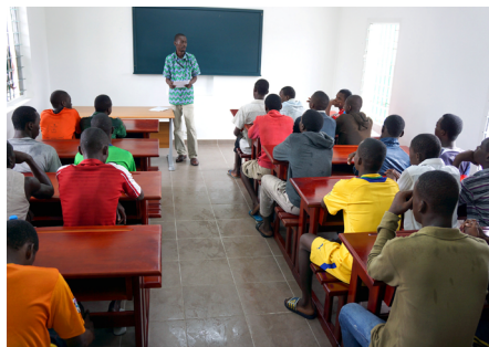
Course in one of the new refurbished class.

Pink was the colour the SBO Foundation decided to sport to begin this pleasant month of October by honouring Gabonese